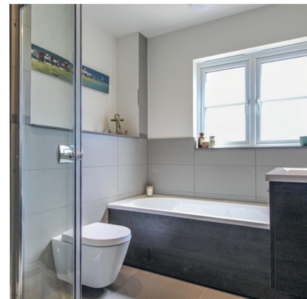
Photographs for illustrative purpose only (Previous Quantum show home)