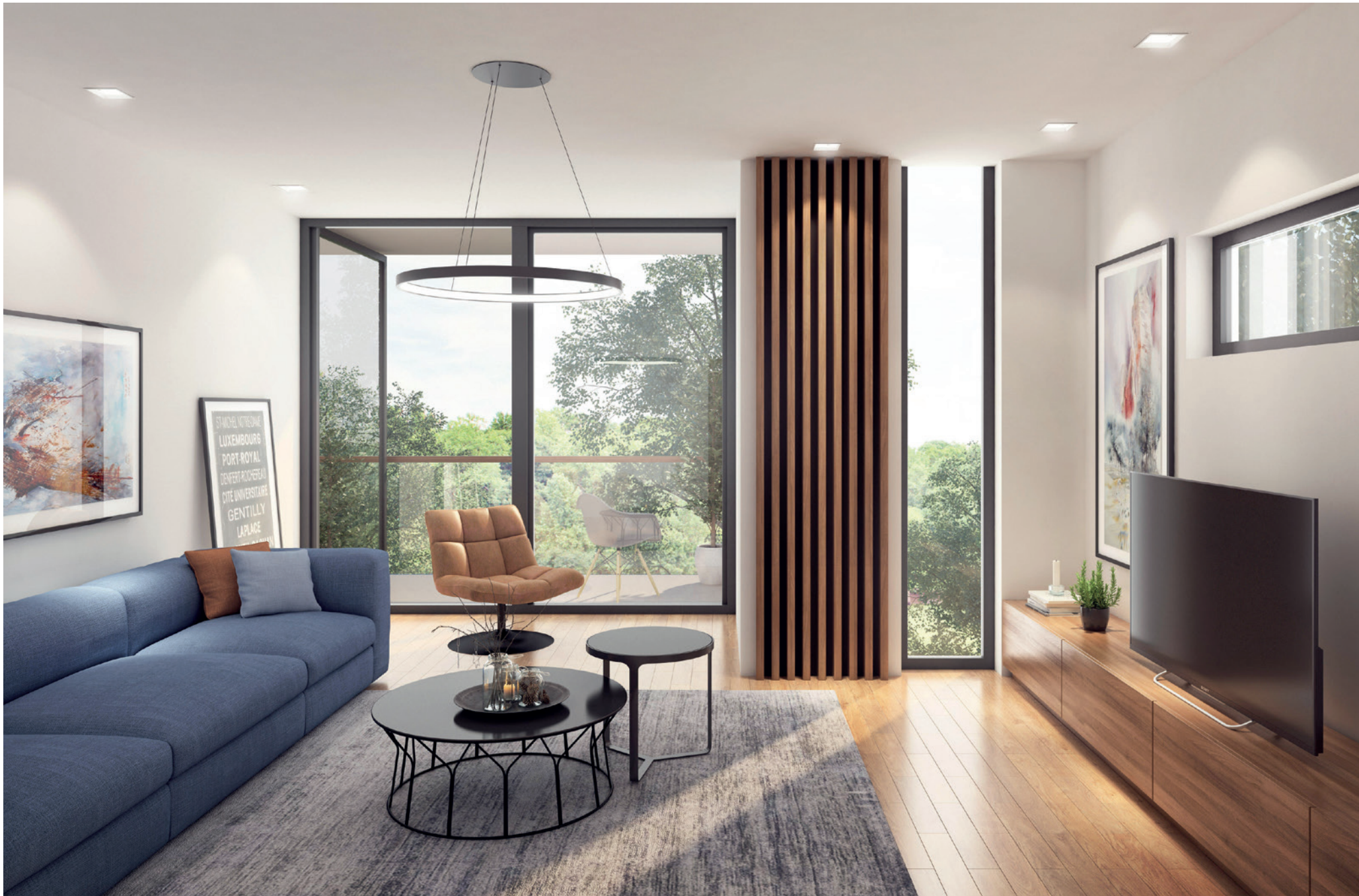
Indication of Plot 6 lounge